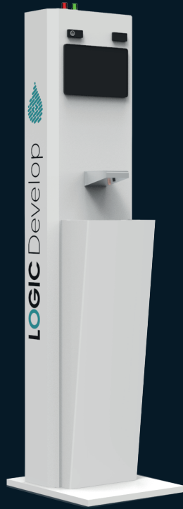
Hand Sanitizer Model 1