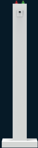
QR/HES-code reader Machine

We offer you 3 types of hightech machines