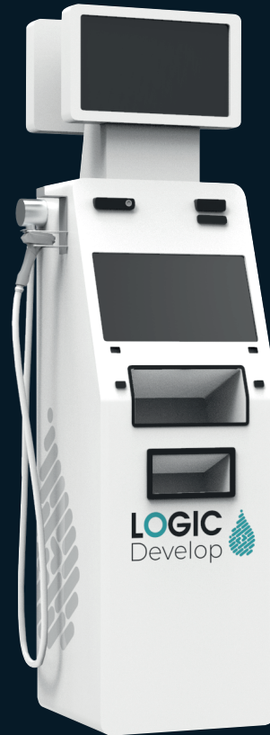
Hand Sanitizer Model 2