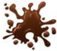
Watery or greasy dirt